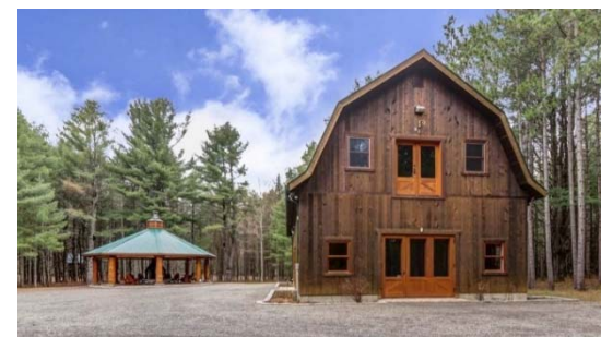
The Reception building

The Shree Guru Shakti Dhams are the abodes of the Guru Energies - where the Energy Statues are established. They are being constructed all over the world including, UK; Australia; South Africa; Singapore and India. The ultimate plan of H. H. Shivkrupanand Swami is to connect all the Energy Centers around world via a Divine Network. These 'Spiritual Light Houses' will meet the needs of mankind and guide millions of seekers of truth for generations to come.